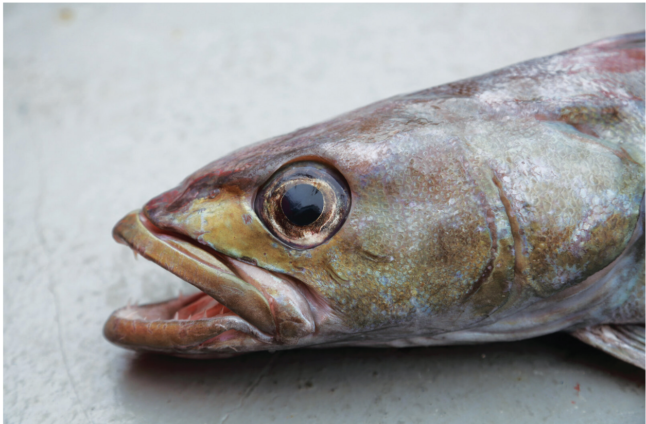
A Patagonian toothfish, also known as Chilean seabass. Australian Fisheries Management Authority

Fishing in the area began with trawling before transitioning to longlining in the mid-1990s. Only 2 fishing companies have access rights to the fishery; they pool their quota allocation, with a single longline vessel taking the entire catch each season.